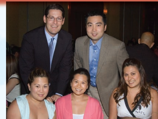
Smith Barney citigroup