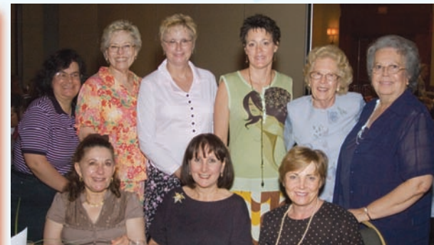
Kelleher & Associates