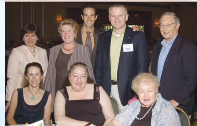
Telesis Community Credit Union