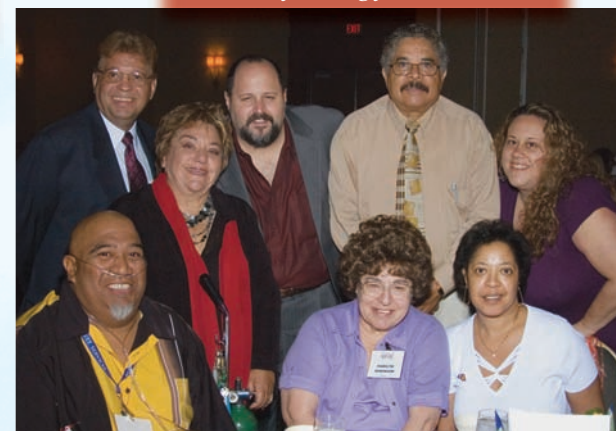
Winnetka Neighborhood Council