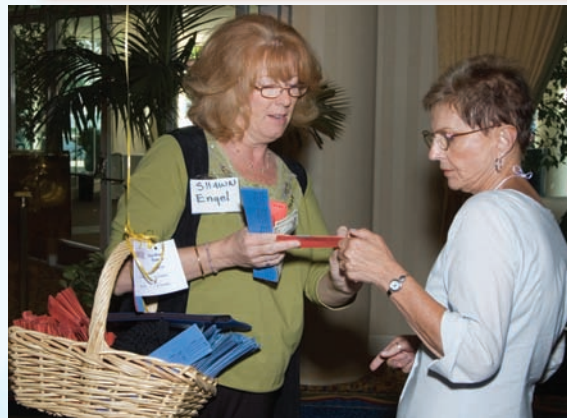
Buying the "lucky ticket"