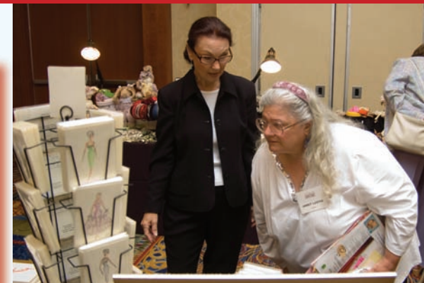
Which cards to buy at the Boutique