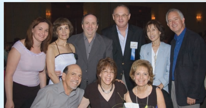
Bank of the West