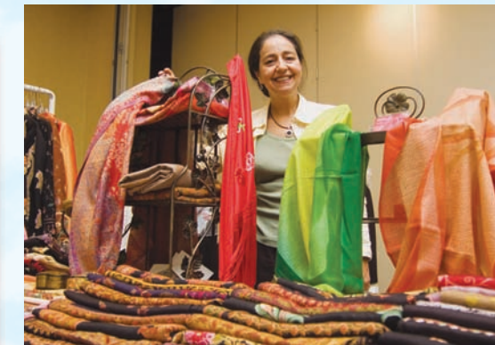
Colorful scarves at the Boutique