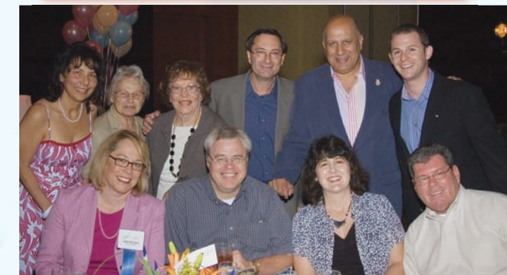
Bank of the West