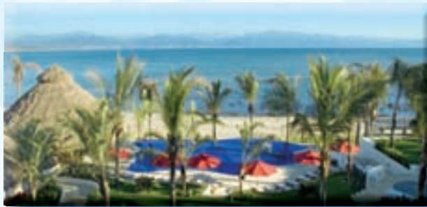
Live Auction Vacation: A week-long stay at the Punta Esmeralda Resort near Puerto Vallarta, Mexico.