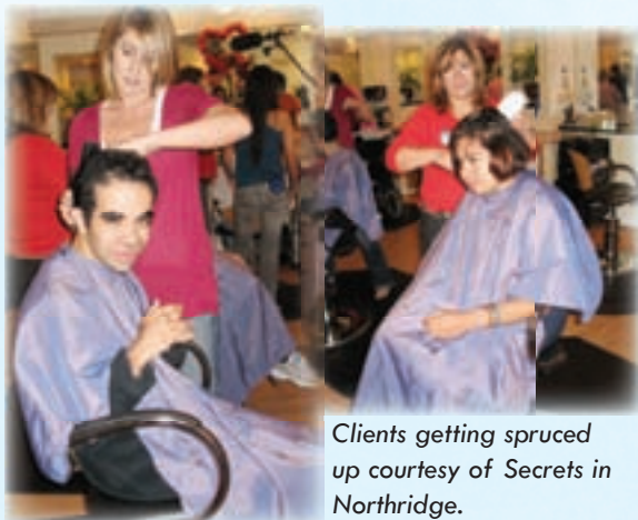
Clients getting spruced up courtesy of Secrets in Northridge.