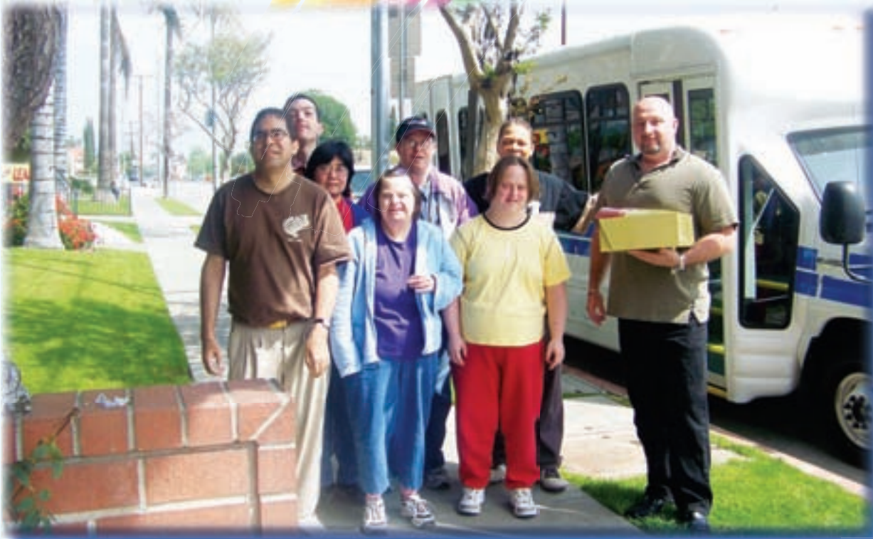
Valley Village clients and staff enjoying a day out in one of the new buses.

Valley Village Foundation Board of Directors