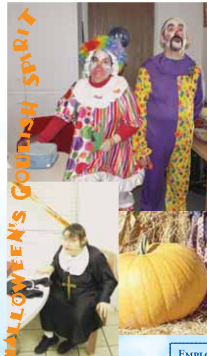
HALLOWEEN'S GOULISH SPIRIT