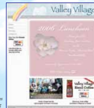
Valley Village's Web site has a sharp, new look. Visit: www.valleyvillage.org .

Enjoy a robust cup of Valley Village coffee with your breakfast. The special blend from Rocky Roaster is $12 per one pound bag. Contact Susan Basler or Jenny Daniels at (818) 587-9450, ext. 120.