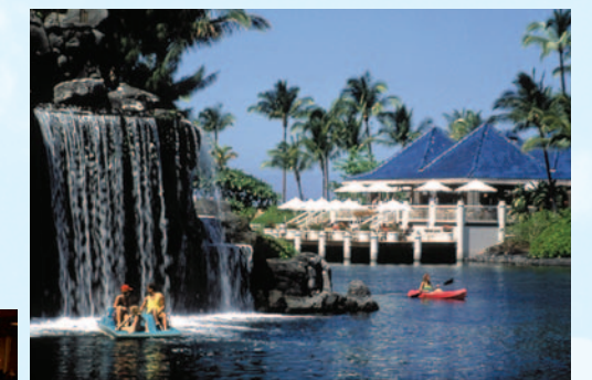
Hilton's Waikoloa Village® resort on the Big Island.

attractions package. Wrapping up the afternoon will be the drawing of the Grand Prize ticket for a 40-inch Sony Bravia TV-HDMI with LCD flat screen donated by the Winnetka Neighborhood Council, and a DVD player. Time Warner Cable will also include a selection of movies and TV shows and coupons good for a year's worth of free Time Warner Cable Movies on Demand. Only 250 of these tickets will be sold at $100 each.