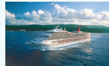
Someone will win a cruise on Carnival Cruise Line.