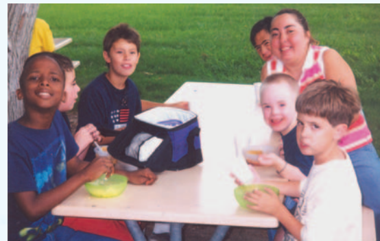
A picnic in the park.

The After School Program is licensed through the Los Angeles County Department of Social Services. There are nine staff members who work with the children and seven for the adult program. The staff is also trained in CPR and first aid.